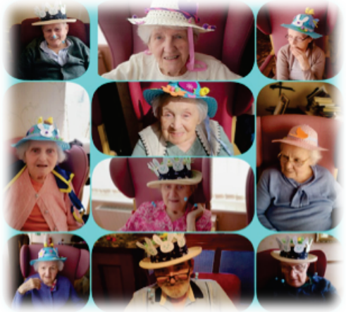
Making Easter bonnets