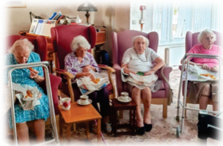
As well as indoors